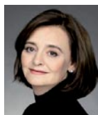
Cherie Blair Patron, AWA

I am very fortunate to have been the long-standing Patron of the Asian Women of Achievement Awards.