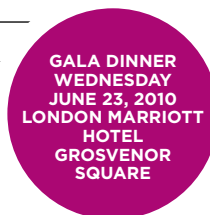
TABLE OF 12: £1,950 (+£341.25 VAT) = £2,291.25

TABLE OF 10: £1,750 (+ £306.25 VAT) = £2,056.25