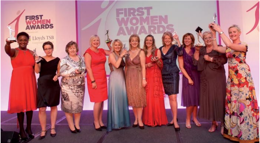
First Women Award Winners 2009

The First Women Awards are one of the biggest events in UK business. In 2009, the awards were covered by UK national and regional print, broadcast and online media, including: